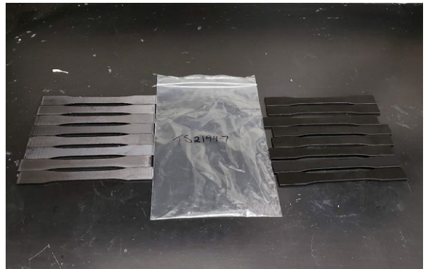
Figure 7. Samples after exposure to Jet A.