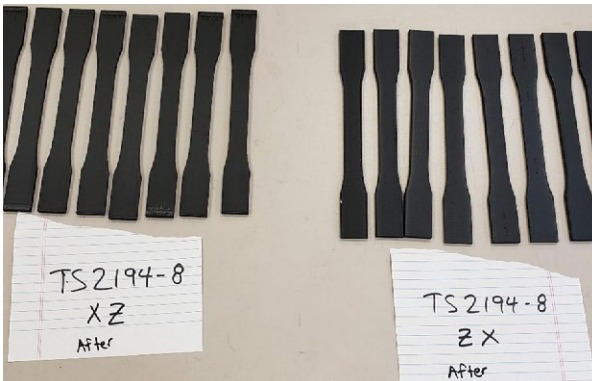
Figure 8. Samples after exposure to 30% nitric acid.