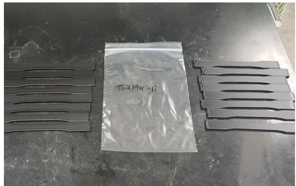
Figure 11. Samples after exposure to concentrated ammonium hydroxide.