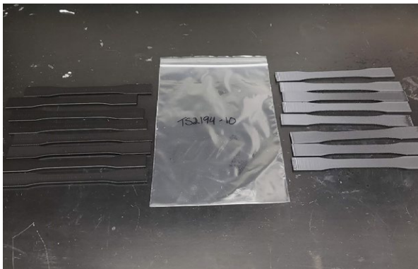
Figure 10. Samples after exposure to 60% sodium hydroxide.