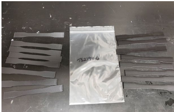
Figure 6. Samples after exposure to toluene.