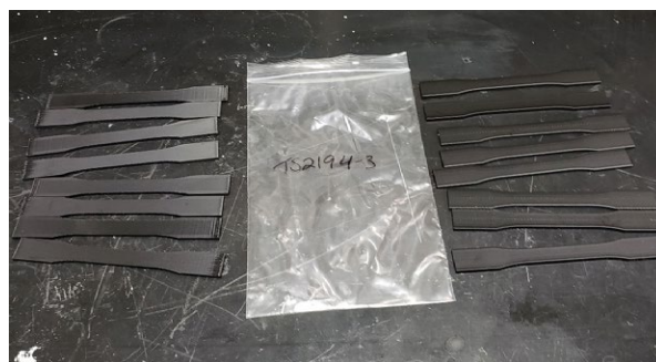
Figure 3. Samples after exposure to MEK.