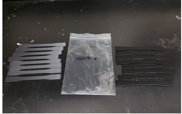
Figure 5. Samples after exposure to ethyl acetate.