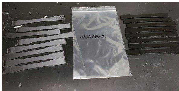
Figure 2. Samples after exposure to Skydrol.

Overall, Antero 840CN03 exhibited very good chemical resistance to the host of chemicals, with the exception of dichloromethane (DCM). Visually, the material's reaction to DCM was especially significant, resulting in an immediate color change. The other chemicals did not visually affect the samples. See figures 1 through 11.