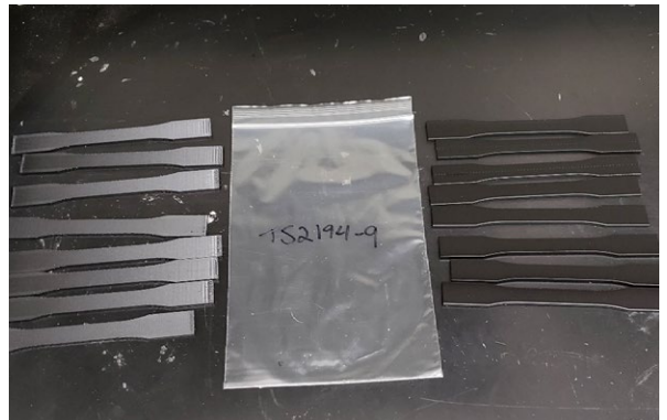
Figure 9. Samples after exposure to 30% sulfuric acid.