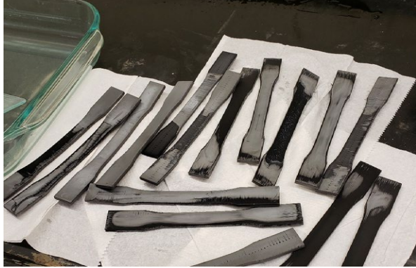
Figure 4. Samples after exposure to DCM.